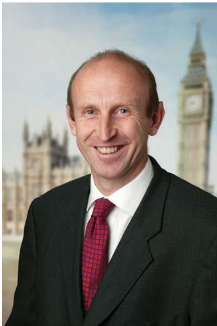
John Healey MP

at the Holiday Inn Express, Manvers Way, Wath upon Dearne, Rotherham, S63 7EQ.