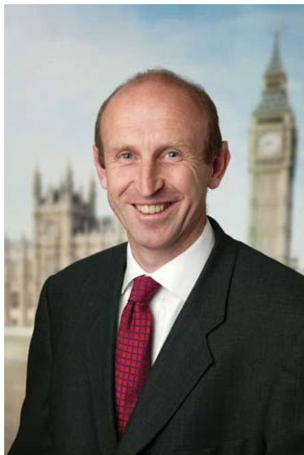
John Healey MP

MPs can assist businesses in a variety of ways, from making private enquiries on their behalf, to raising matters publicly in the House of Commons.